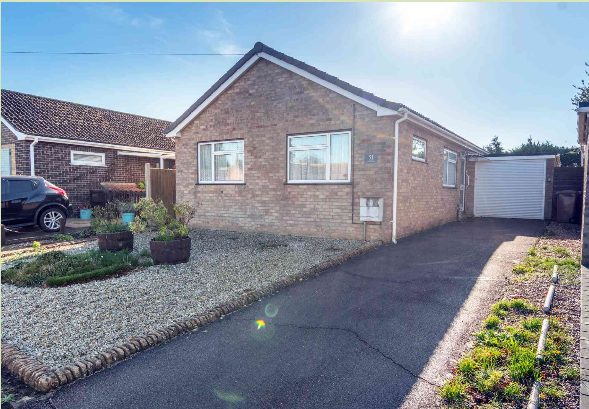
51 Waveney Close, Wells-next-the-Sea Guide Price £425,000