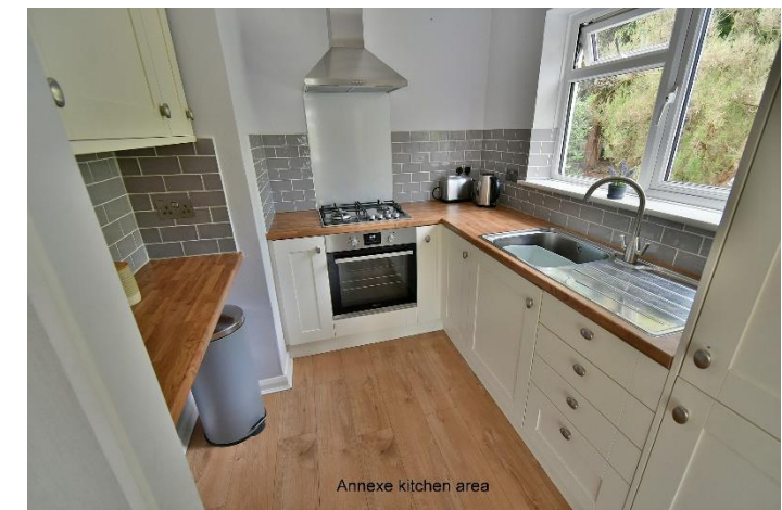
Annexe kitchen area