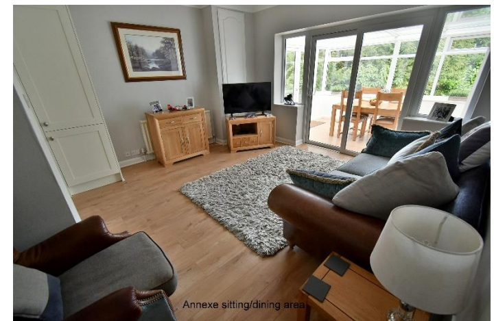
Annexe sitting/dining area