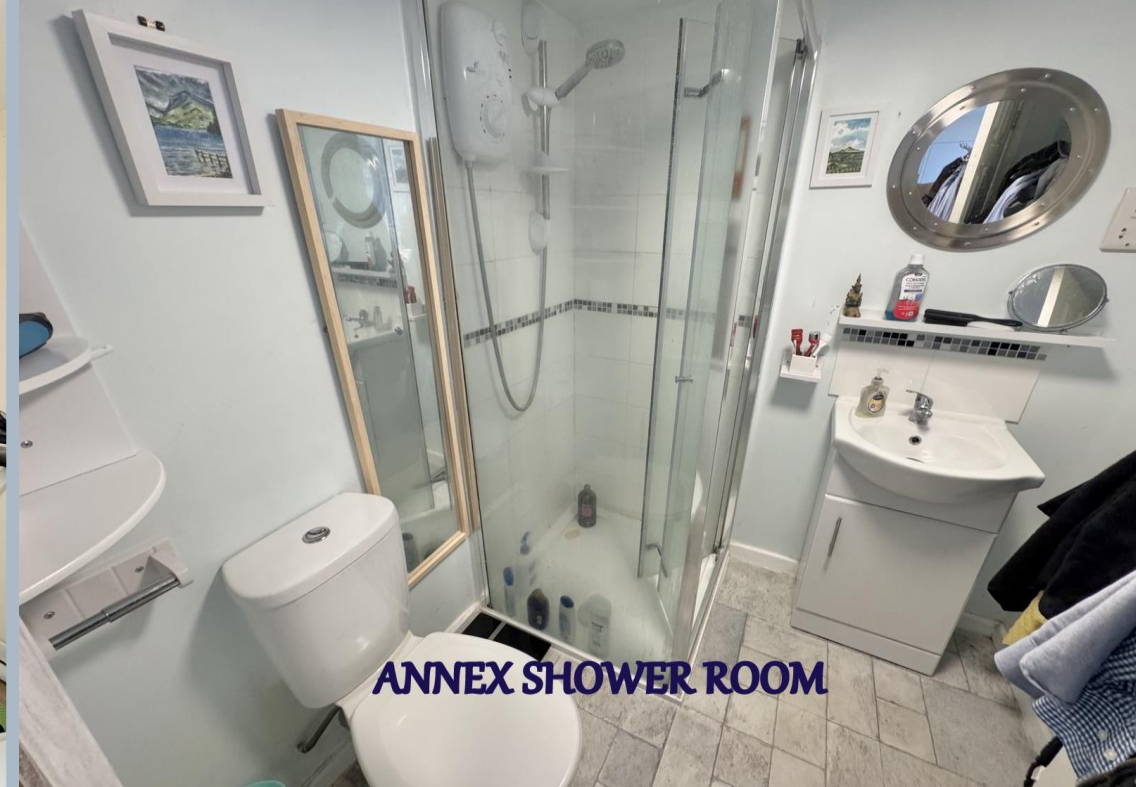
ANNEX SHOWER ROOM