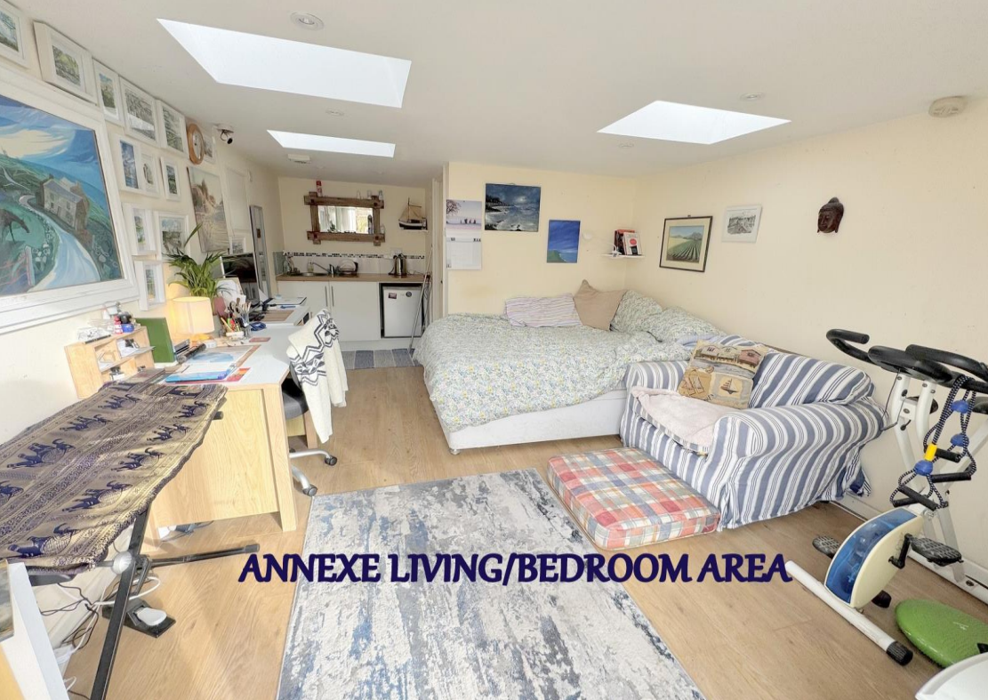
ANNEXE LIVING/BEDROOM AREA