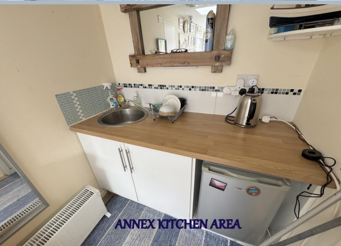
ANNEX KITCHEN AREA