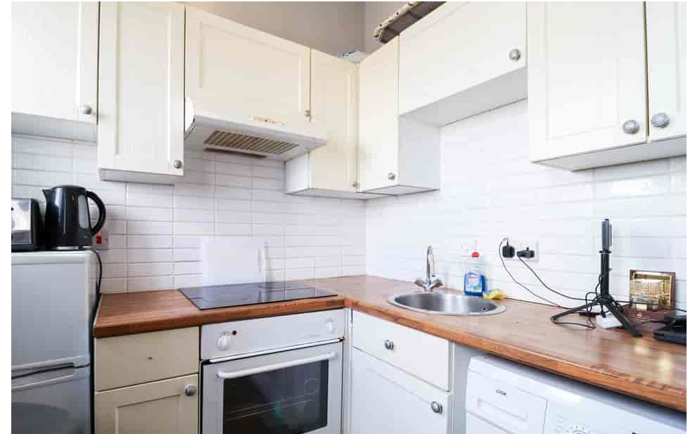
Galliard Court, Baronson Gardens, Northampton NN1 4NU Offers Over £80,000 - Leasehold