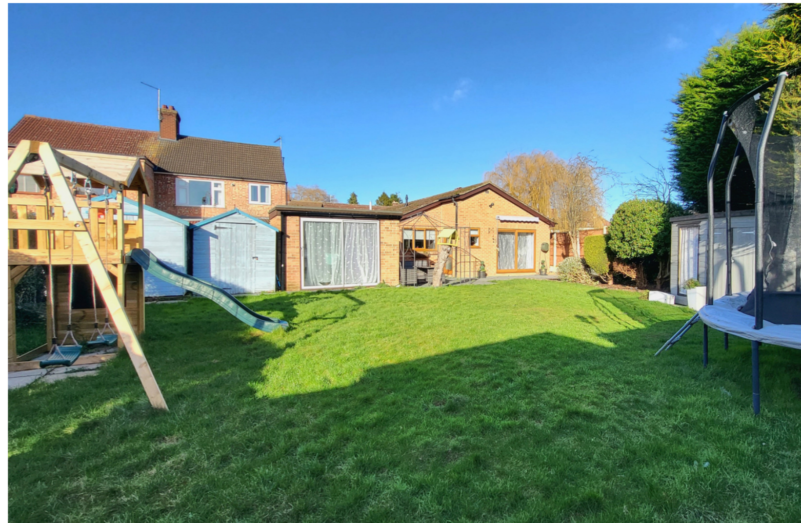
1a Mead Close, Walton PE4 6BS