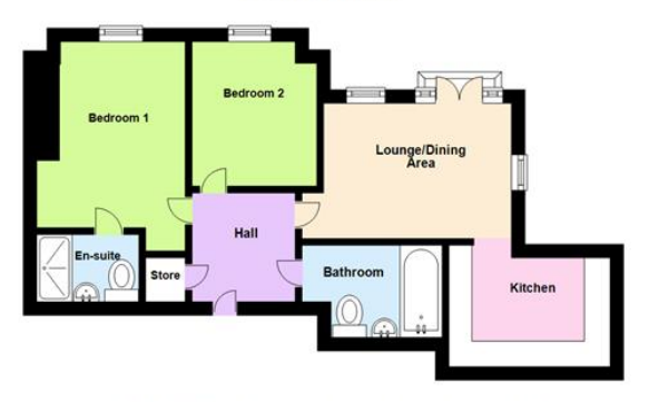
Floor plans are for layout purposes only. Measurements are approximate and subject to inaccuracies Plan produced using PlanUp.