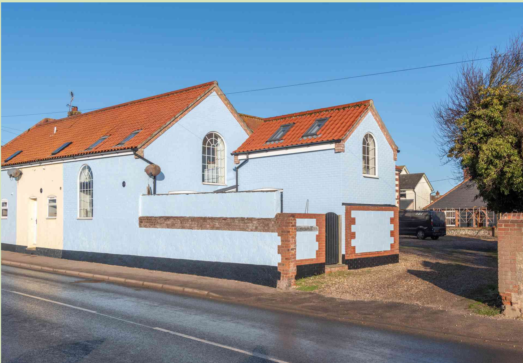
1 Claxtons Yard, Wells-next-the-Sea Guide Price £399,950