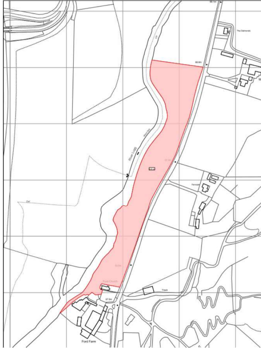
Plan not to scale for illustration purpose only