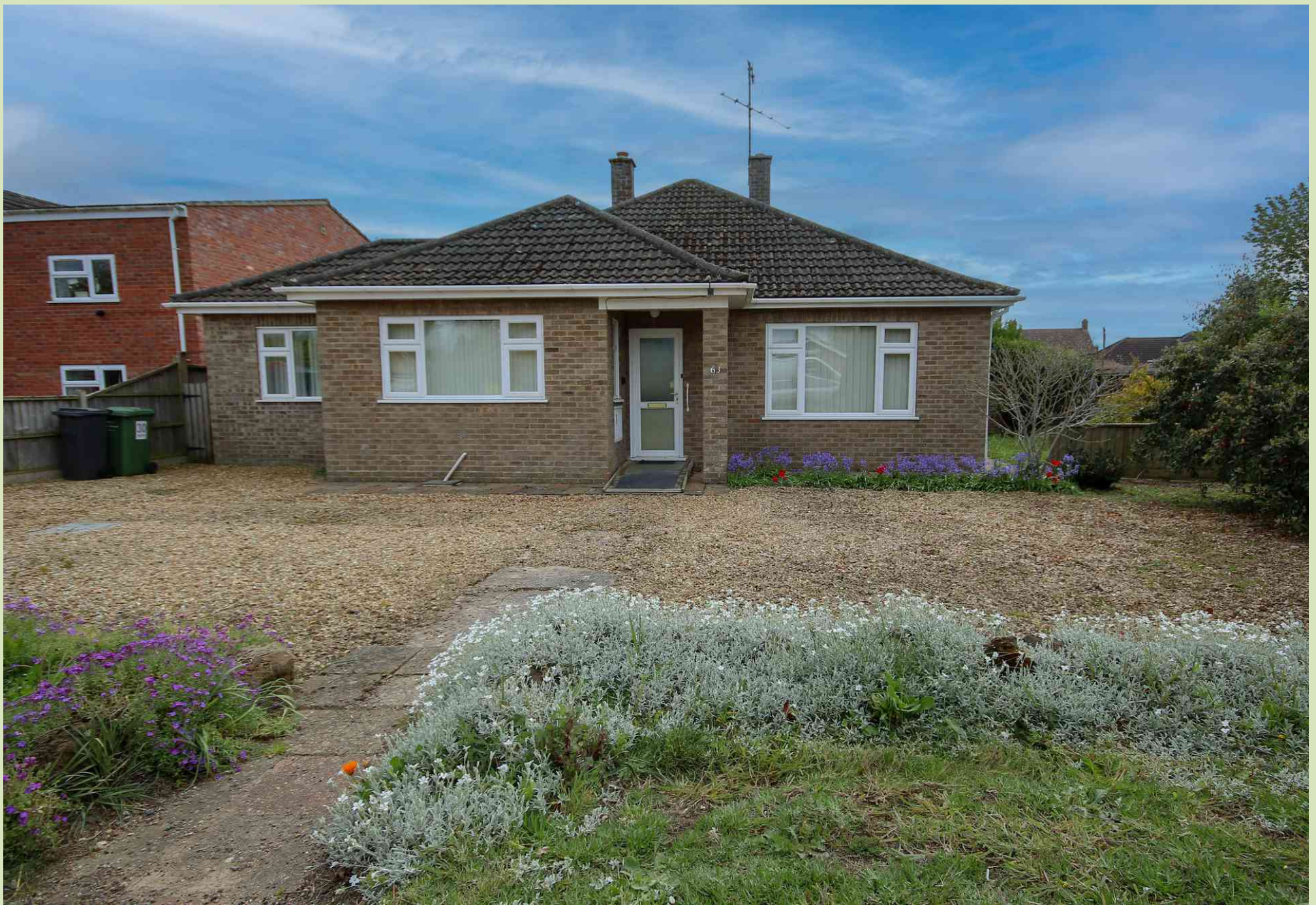
63 St Johns Road, Tilney St Lawrence Guide Price £285,000