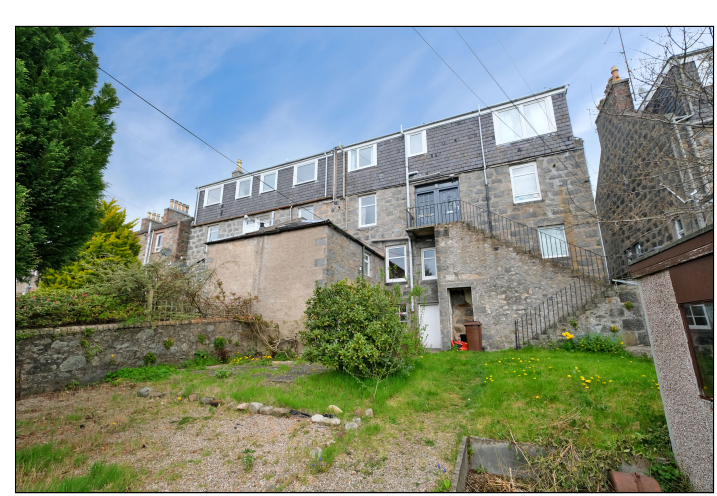
COUNCIL TAX BAND - C EPC BANDING -