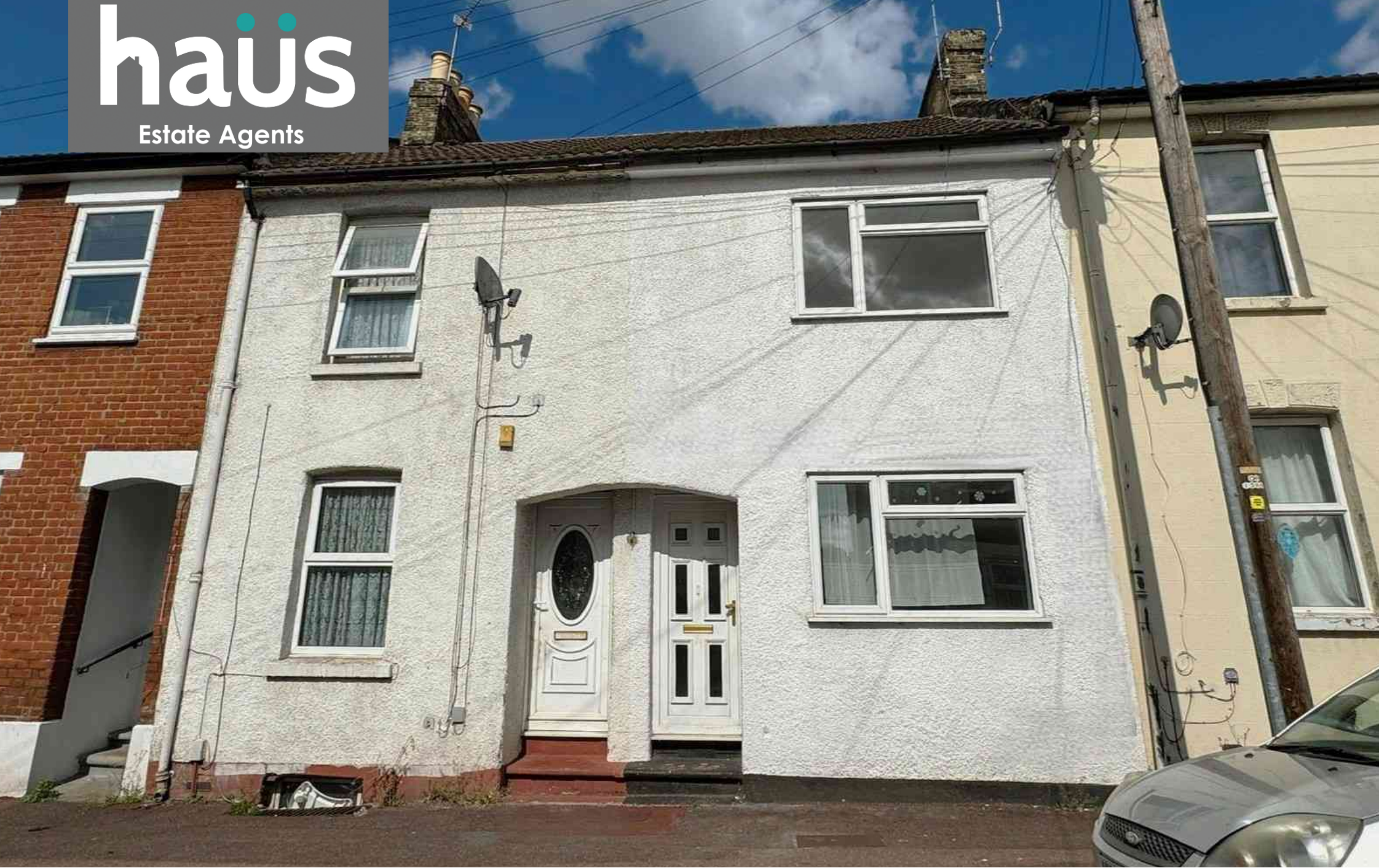
Two Bedroom Terraced House Thorold Road, Chatham, Kent, ME5 7DS