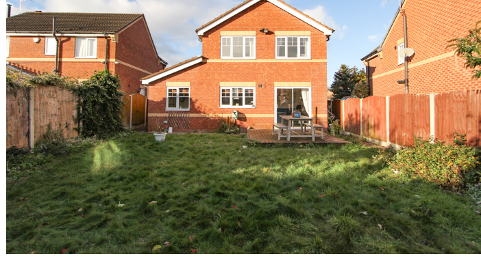
Property Information Form

Council Tax Band - D Utilities - Mains Gas, Mains Electricity, Mains Water Water Meter - Yes Average Annual Electricity Bills - £800 Average Annual Gas Bills -Average Annual Water Bills -