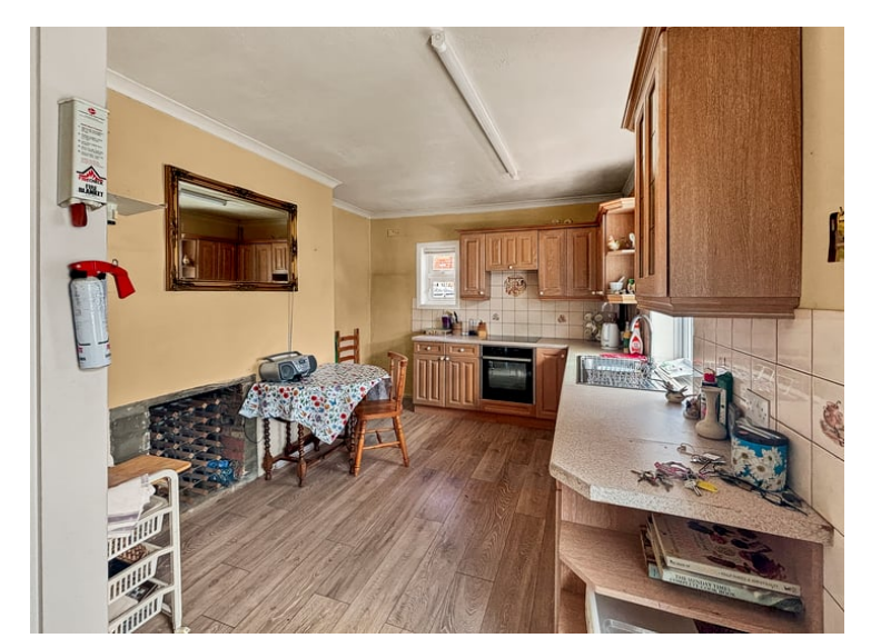
15' 3" x 9' 3" (4.65m x 2.82m) Double glazed window to rear and side, UPVC door, range of wall and base units, tiled splash back, laminate worktop, stainless steel sink, Neff oven and induction hob, over head cooker hood, space for washing machine, fridge/freezer.