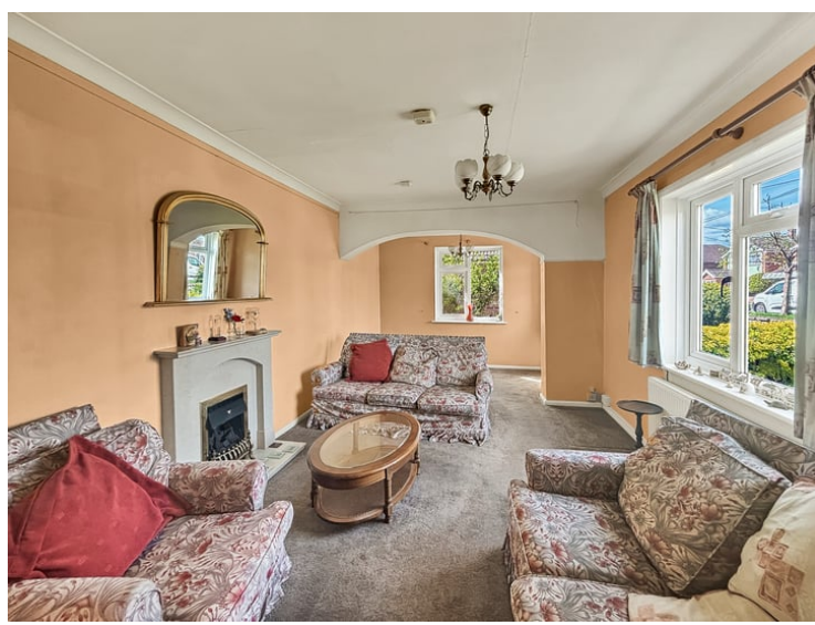
20' 11" x 10' 3" (6.38m x 3.12m) Double glazed window to front and side, gas fireplace.