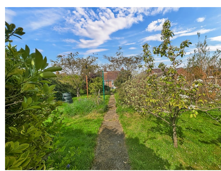
Mainly laid to lawn a generous rear garden with mature shrubs, tree and garden shed, retained by fencing.