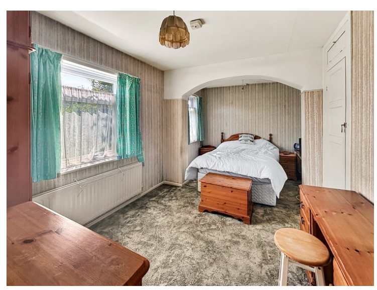
16' 4" \times 10' 6" (4.98m x 3.20m) Double glazed window to front, radiator, fitted wardrobes.