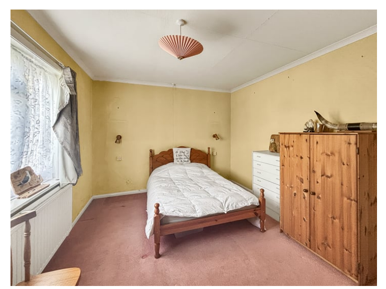
14' 2" \times 11' 0" (4.32m \times 3.35m) Double glazed windows to rear, radiator, fitted cupboard.