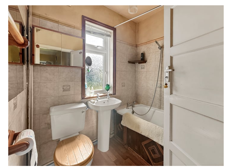
20' 11" x 10' 3" ( 6.38 \, \text{m} \times 3.12 \, \text{m} ) Double glazed window to rear, radiator, panelled bath, low level WC, wash hand basin.