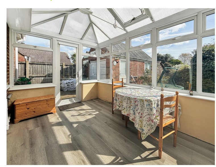
13' 7" x 8' 8" (4.14m x 2.64m) Double glazed windows to rear and side, UPVC door to side.