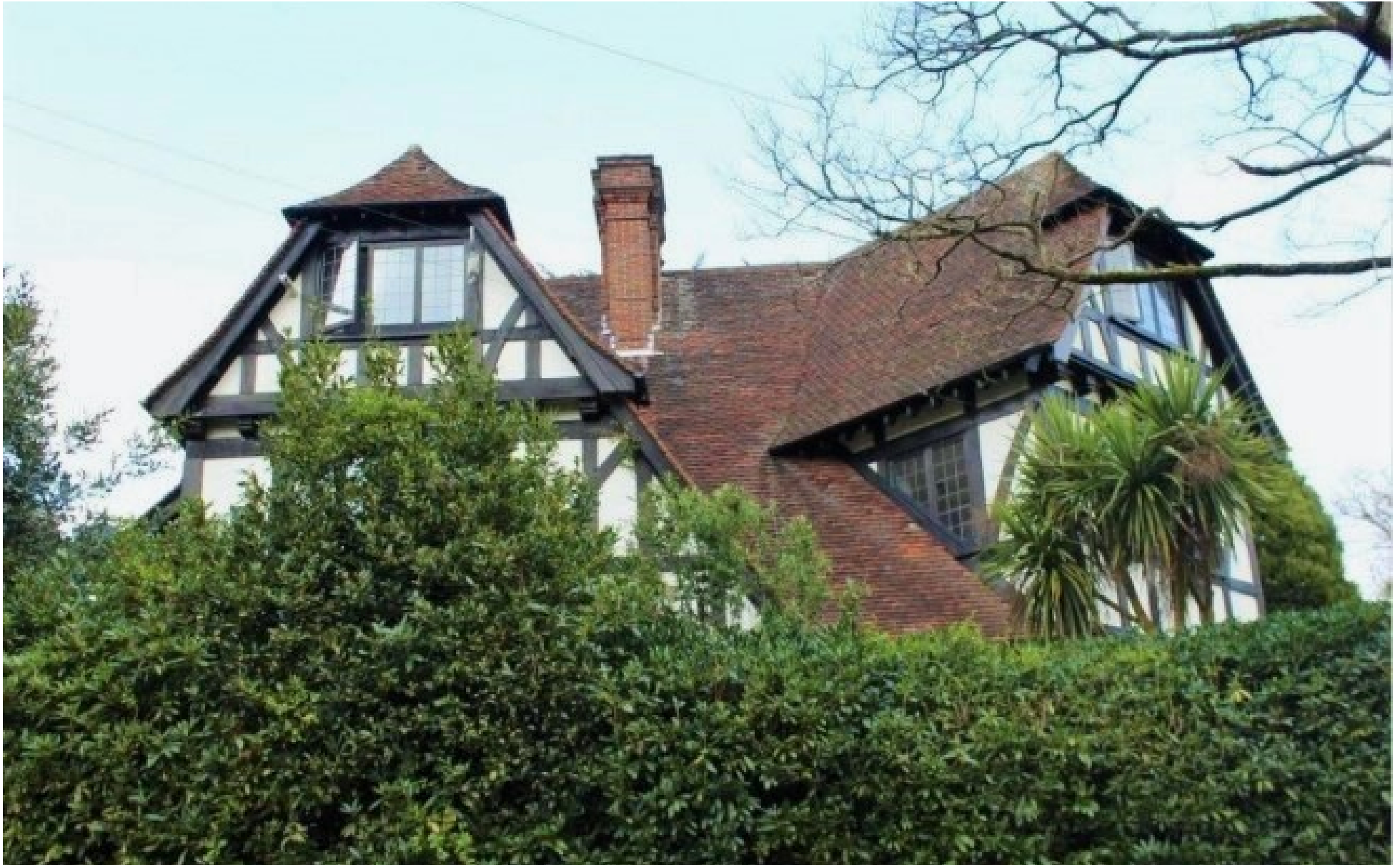
Alumdale Road, Bournemouth BH4 8HX