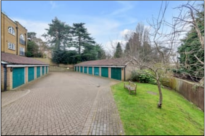
There is a brick built garage with remote electrically operated up and over door, power supply.

Within the block of 13 apartments is a two bedroomed suite on the second floor available to provide guest accommodation for overnight visitors.