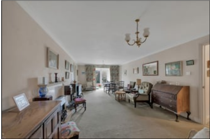
27' 7" x 12' 6" (8.41m x 3.81m) Coved cornice, ornamental fireplace, double radiator, Juliet balcony with double glazed opening doors and double glazed side windows with South Westerly aspect and electronically operated sun blind.

cupboard, alcove with fitted shelves, downlighting and cupboard under, radiator, entry phone, airing cupboard with modern hot water cylinder.