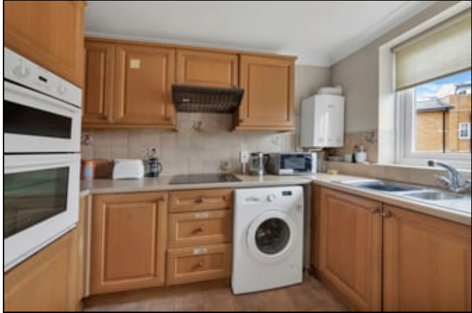
9' 8" x 8' 1" (2.95m x 2.46m) fitted with a range of wood fronted wall and base units, worktops, double glazed window to rear, Worcester Bosch gas fired boiler serving the central heating, one and half bowl single drainer stainless steel sink unit, integrated Indesit electric induction hob, extractor canopy over, Electrolux integrated double oven, integrated fridge/freezer and second fridge, skirting convactor heating.