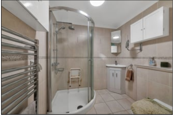
6' 0" x 6' 5" (1.83m x 1.96m) Large shower cubicle, wash hand basin set into vanity unit with mixer tap, low level W.C., with a concealed cistern, shaver point, fully tiled walls, coved cornice, ceramic tiled floor, tubular heated towel rail.

6' 7" x 3' 0" (2.01m x 0.91m) Low level W.C., wash hand basin, radiator, fully tiled walls, shave point, coved cornice, extractor fan.