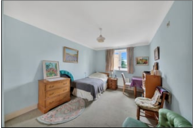
15' 6" x 9' 4" (4.72m x 2.84m) built in wardrobe cupboards with floor to ceiling mirrored doors, double glazed window to the rear, coved cornice.

18' 6" x 11' 2" (5.64m x 3.40m) Juliet balcony with double glazed opening doors and double glazed side windows with south westerly aspect, built in wardrobe cupboards with floor to ceiling sliding mirrored doors, coved cornice, double radiator.