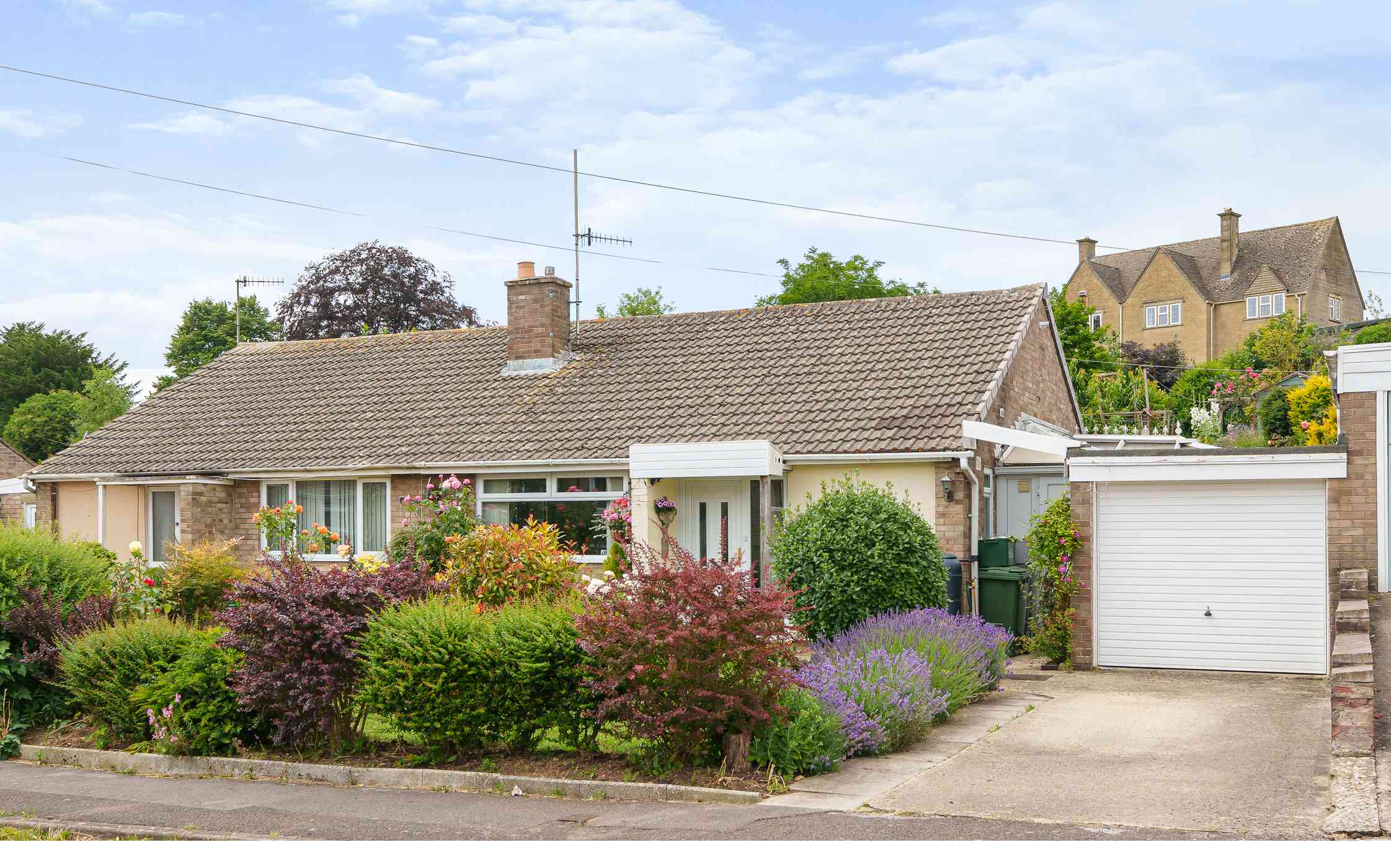
27 Maple Drive, Stroud, Gloucestershire, GL5 4DE Guide Price £325,000