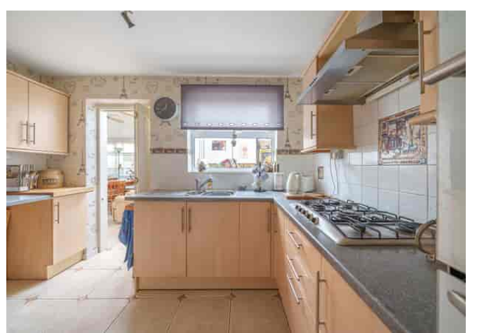
27 Maple Drive, Stroud, Gloucestershire, GL5 4DE

A well-proportioned two bedroom semi-detached bungalow sat in a generous plot on Maple Drive in Farmhill with conservatory/dining room, parking/garage and a lovely well-stocked terraced garden.