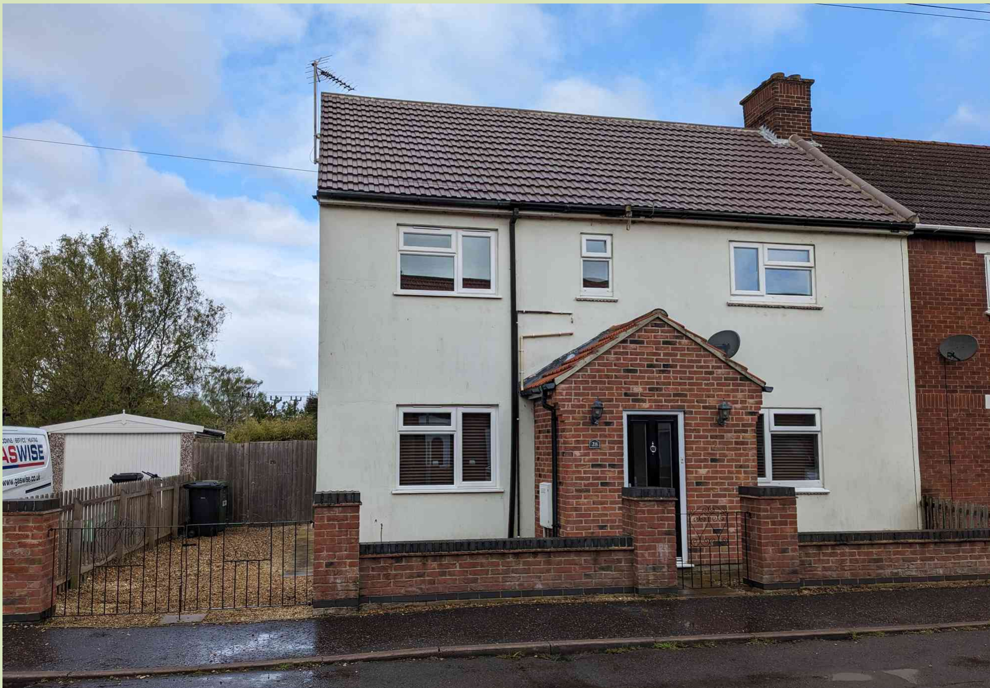
28 Kings Avenue, King's Lynn Guide Price £289,000