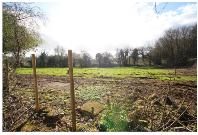
Auction Guide Price £190,000 to £210,000*

Thursday 25<sup>th</sup> April 2024, 12pm The Theatre, The Royal Bath and West Showground, Shepton Mallet, BA4 6QN Bid remotely via Livestream, in person or by proxy.