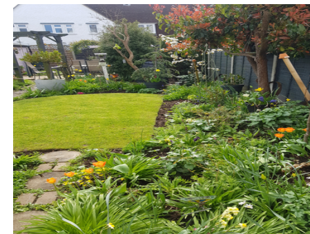
Jackmans Place, Letchworth Garden City, Hertfordshire, SG6 1RH