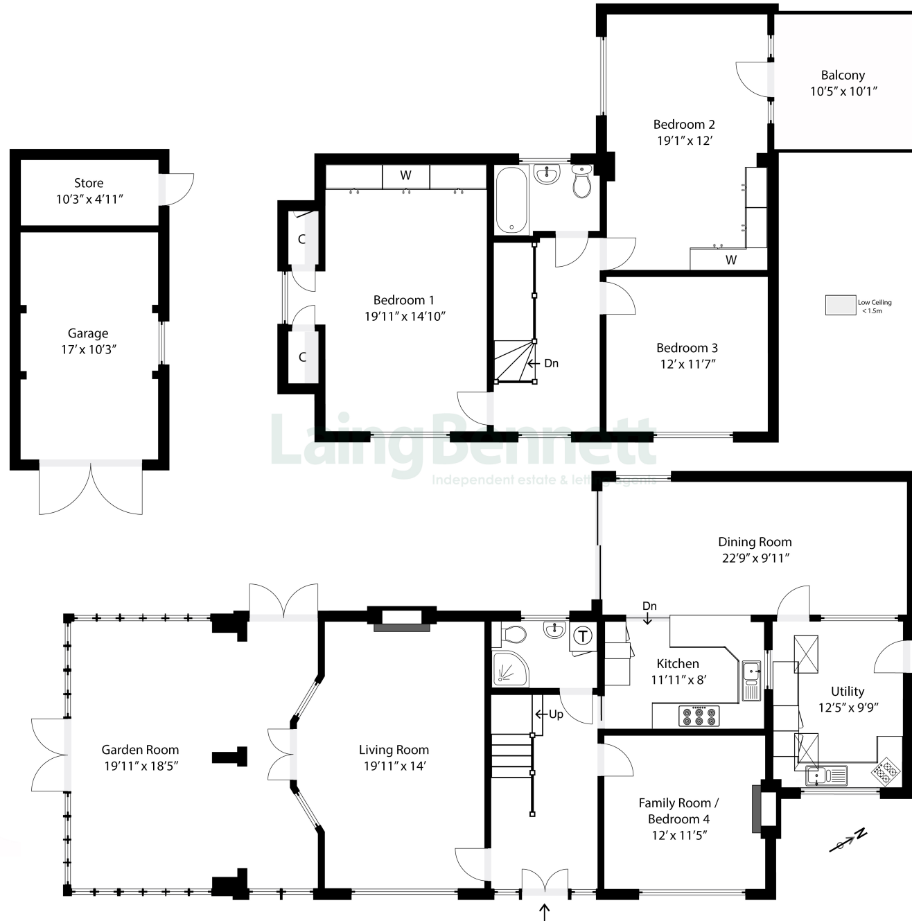
Illustration for identification purposes only. Measurements are approximate. Dimensions given are between the widest points. Not to scale. Outbuildings are not shown in actual location.

Approximate Gross Internal Area (Excluding Balcony, Including Low Ceiling) = 207 sq m / 2226 sq ft Outbuildings / Garage = 21 sq m / 230 sq ft