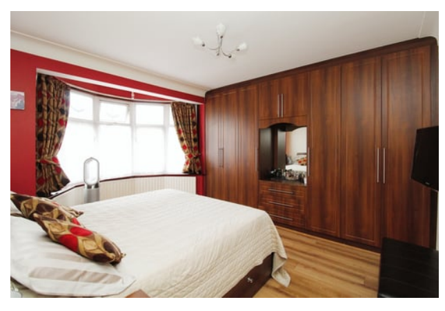
BEDROOM TWO 10' 7" x 12' 1" (3.23m x 3.68m) Double glazed picture and casement window to rear, laminate flooring, double radiator, power points, wall light points, fitted wardrobes.

10' 7" to wardrobes x 15' 3" to bay (3.23m x 4.65m)Double glazed coloured leaded light round bay window to front, laminate flooring, single radiator, full height fitted wardrobes with vanity desk unit and bedside units.