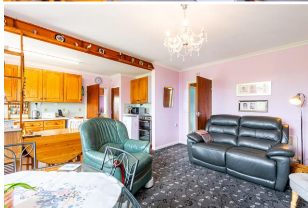
OPEN PLAN DINING/LOUNGE/KITCHEN