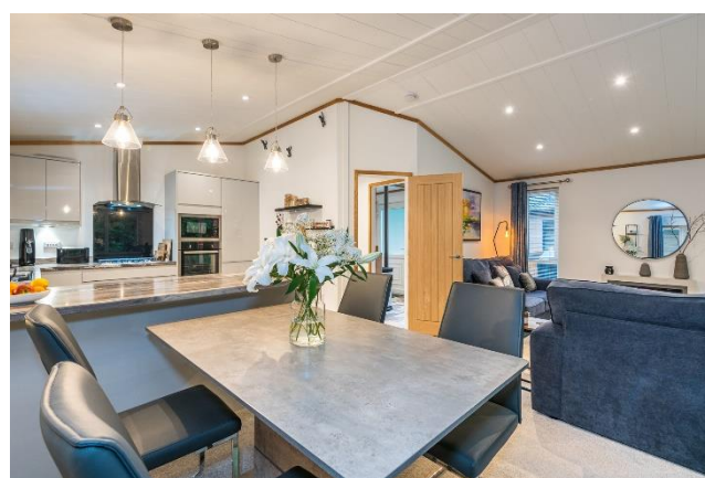
OPEN PLAN LIVING/DINING AREA

KITCHEN (12' x 10'5) Fitted kitchen with built-in oven and microwave, hob with extractor hood above, integrated fridge freezer, wine cooler, washing machine and dishwasher. Breakfast bar, UPVC double glazed window to the side and radiator.