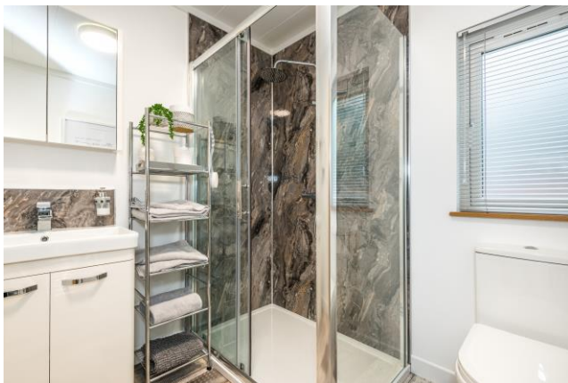
EN-SUITE TO MASTER

EN-SUITE SHOWER ROOM Shower cubicle, WC and wash hand basin with storage below. Wall cabinet, heated towel rail and UPVC double glazed window to the side.