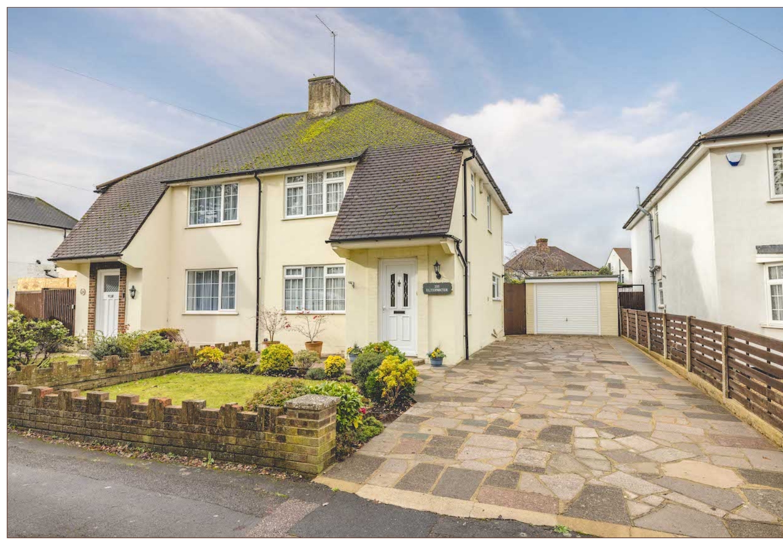
Oakwood Estates is delighted to present this impeccably maintained, spacious three-bedroom, two-reception semi-detached property to the market. It boasts a sizable conservatory, an expansive southwest-facing rear garden, a generously proportioned garage, and substantial development potential for a two-floor side extension, a ground-floor rear extension, and an outbuilding at the end of the garden (subject to planning permission). The property offers convenient access to local schools, amenities, and travel links. Additionally, a spacious driveway accommodates multiple cars.

Upon entering the property through the main entrance hallway, you're greeted by carpeted floors, stairs ascending to the first floor, a side-facing window, built-in storage, and doors leading to both the kitchen and living room. The living/dining area, spanning 10'1" x 23'2", boasts a sizable front-facing window, offering ample natural light. This versatile space accommodates a dining table and chairs, living room furniture, a featured fireplace, and a sliding door leading to the conservatory. The conservatory itself is adorned with ceramic tiled flooring, French doors opening to the patio, and a generous room for either living or dining furniture. The wellequipped kitchen includes an array of wall-mounted and base units, a tiled splashback, sink and drainer with a mixer tap, space for a range-style oven and hob, under-counter fridge/freezer, dishwasher, a frosted side-facing window, and a door and window providing access to the patio.