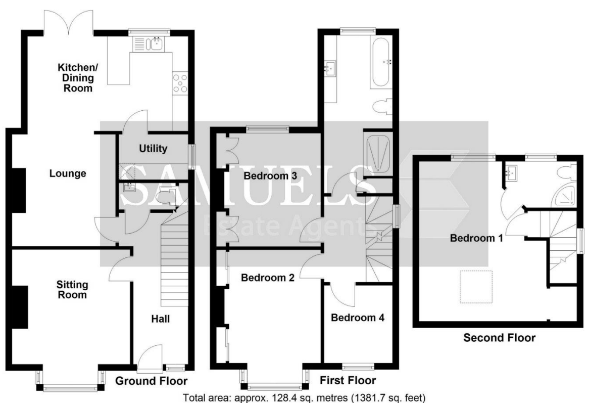
Floor plan for illustration purposes only - not to scale