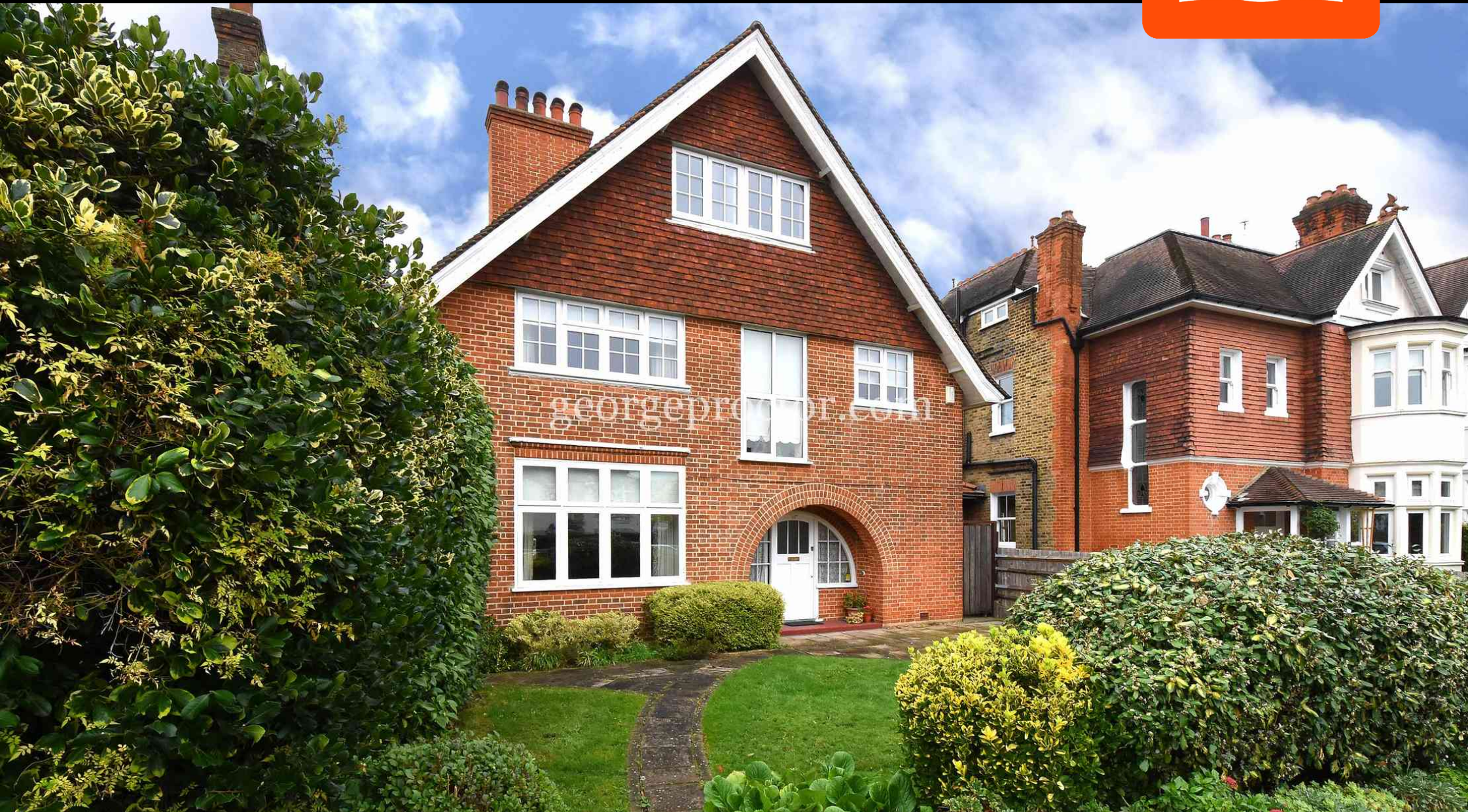
Shawfield Park, Bickley, Kent. BR1 2NQ