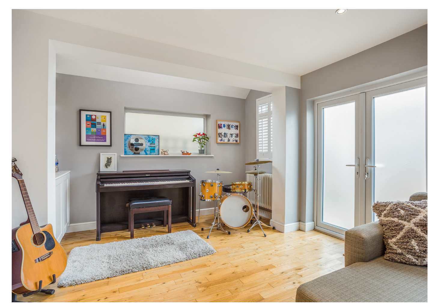
2 BEDROOM FLAT