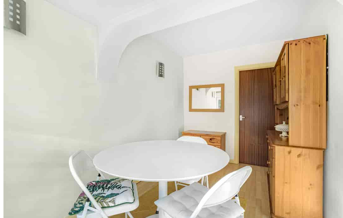
61 Furlong Road, Bourne End, Buckinghamshire SL8 5AG Guide Price £450,000 - Freehold