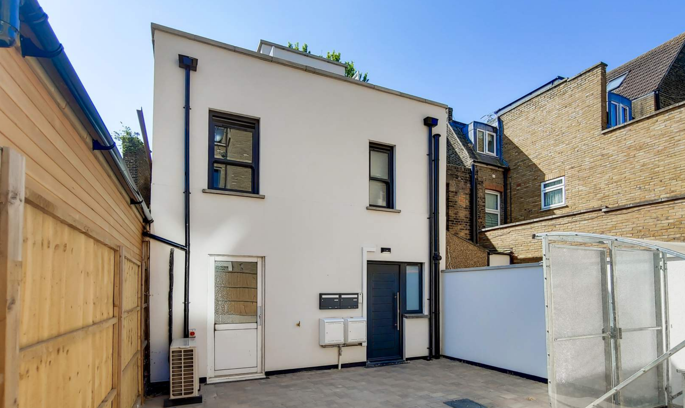
2A Flat 1, Cherington Road, Hanwell, London. W7 3HJ. £375,000