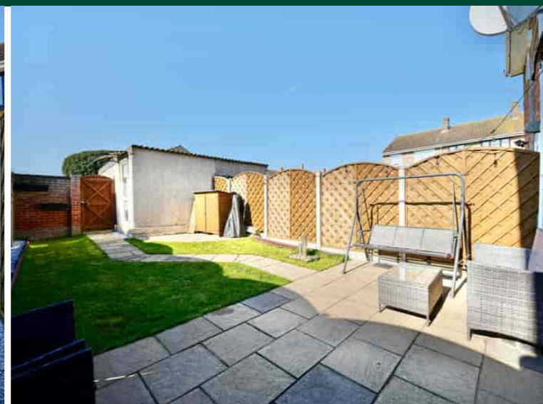
Prospero Way, Hartford PE29 1PQ