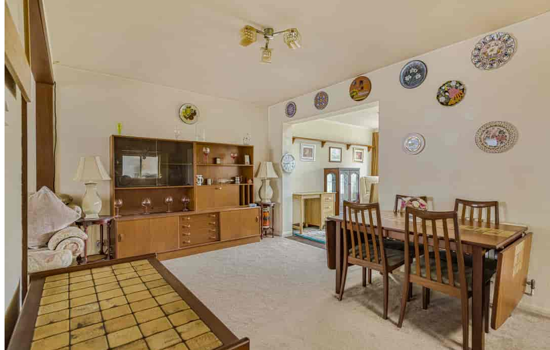
26 Barnhill Road, Marlow, Buckinghamshire SL7 3EY Offers in the Region of £650,000 - Freehold