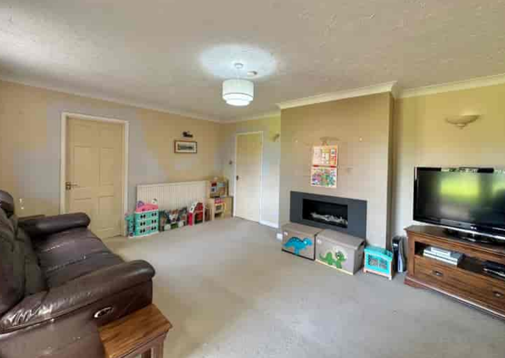
• Detached property • Highly desirable village location • Four reception rooms • En-suites off three bedrooms • Detached garage • Large driveway