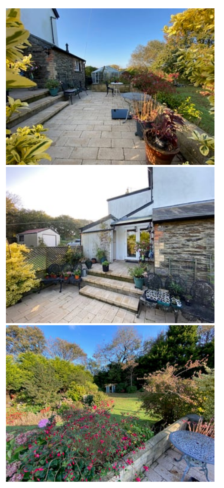
Lean to Stone built Store Shed/Fuel Store

Privately positioned slightly raised paved patio area with access to outside WC.