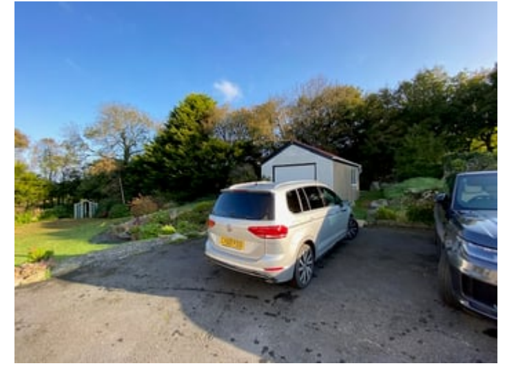
Detached Single Garage With up and over door.