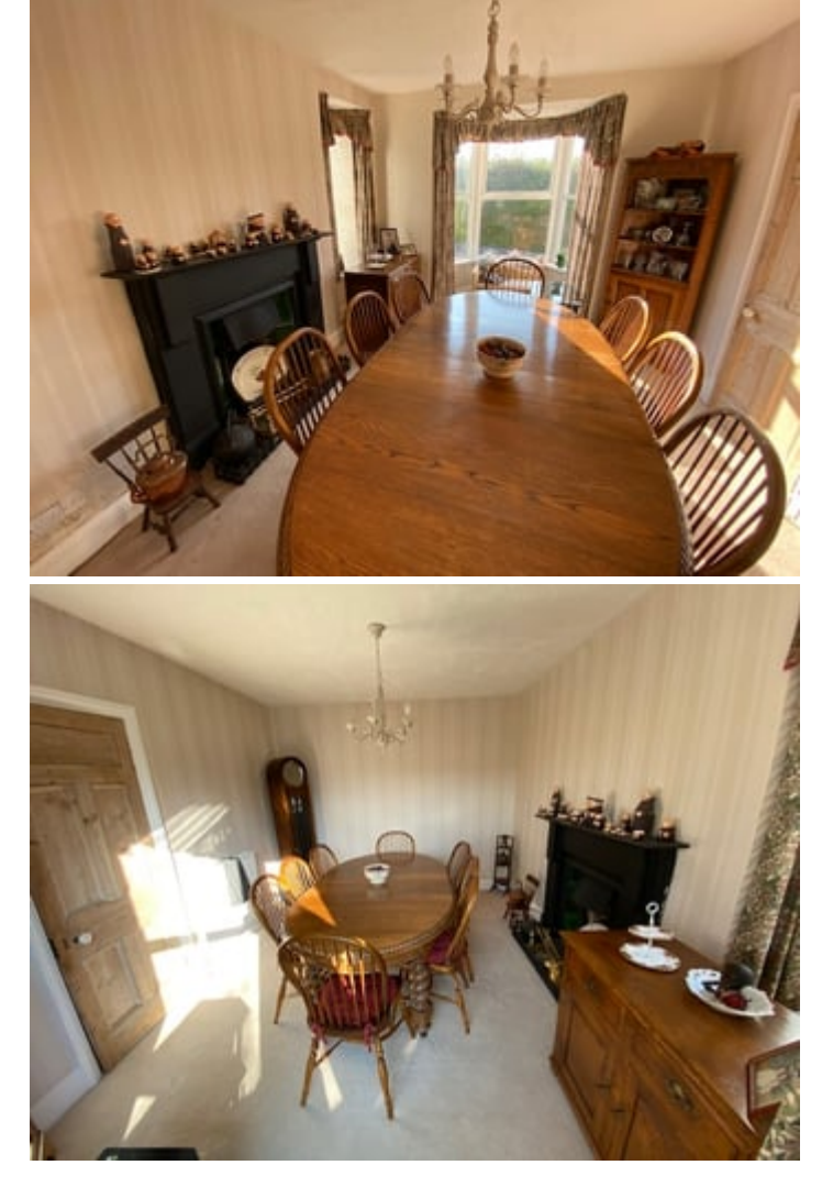
Rear Breakfast Room