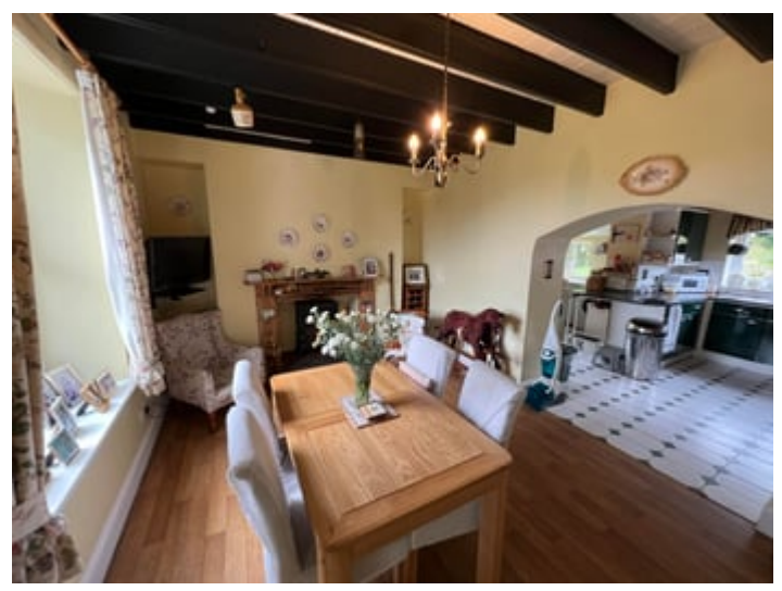
14' 8" x 11' 1" (4.47m x 3.38m) ) with a fireplace housing a multifuel stove on a tiled hearth with antique wood surround, alcoves to each side, exposed ceiling beams, under-stairs storage cupboard, side aspect window, side door and door to storm porch.