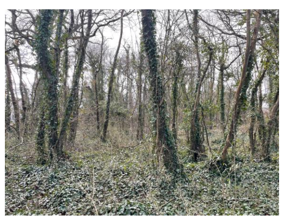
Auction Guide Price: £15,000 to £25,000*

Wednesday 14<sup>th</sup> May 2025, 12 midday The Theatre, The Royal Bath and West Showground, Shepton Mallet, BA4 6QN Bid remotely via Livestream, in person or by proxy.