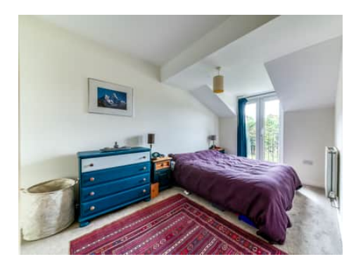
St James Place, Normanton Road, South Croydon, Surrey, CR2 £325,000 Leasehold