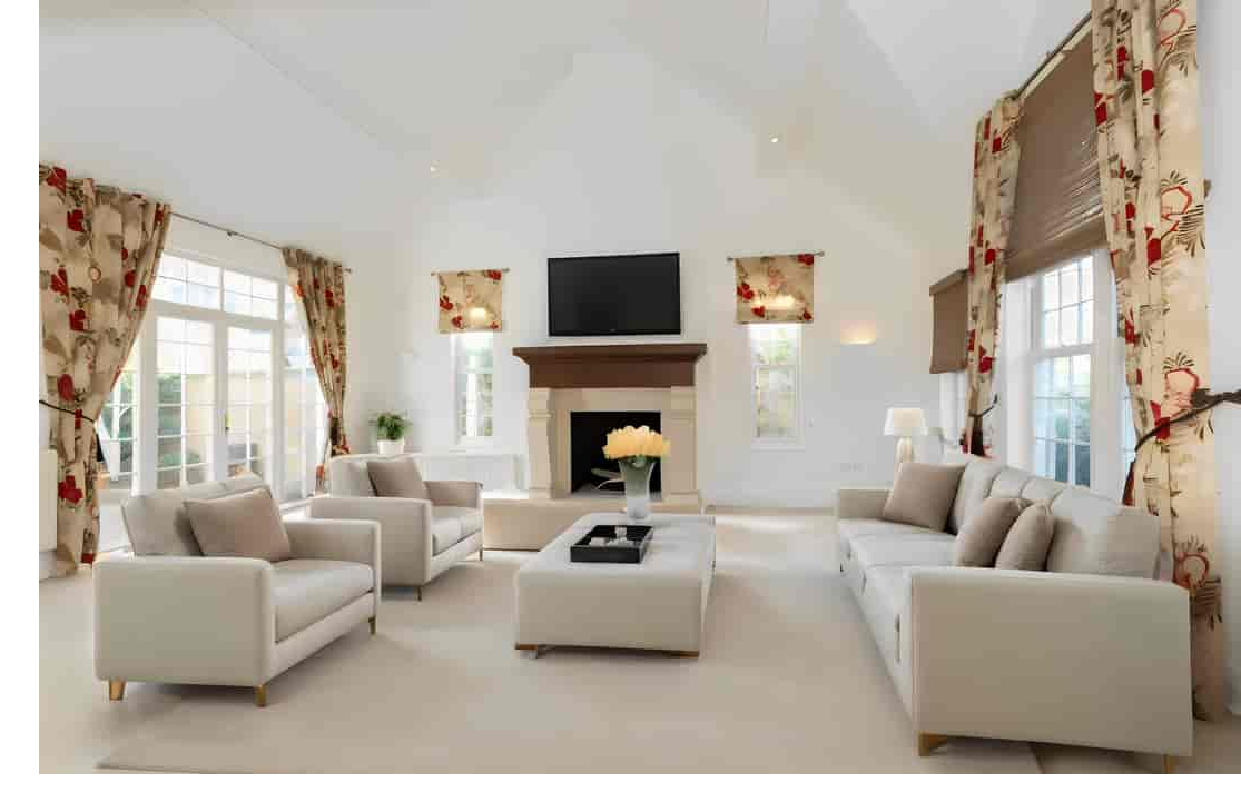
28 Frances Green, Beaulieu Park, Chelmsford, Essex CM1 6EG £1,350,000 - Freehold