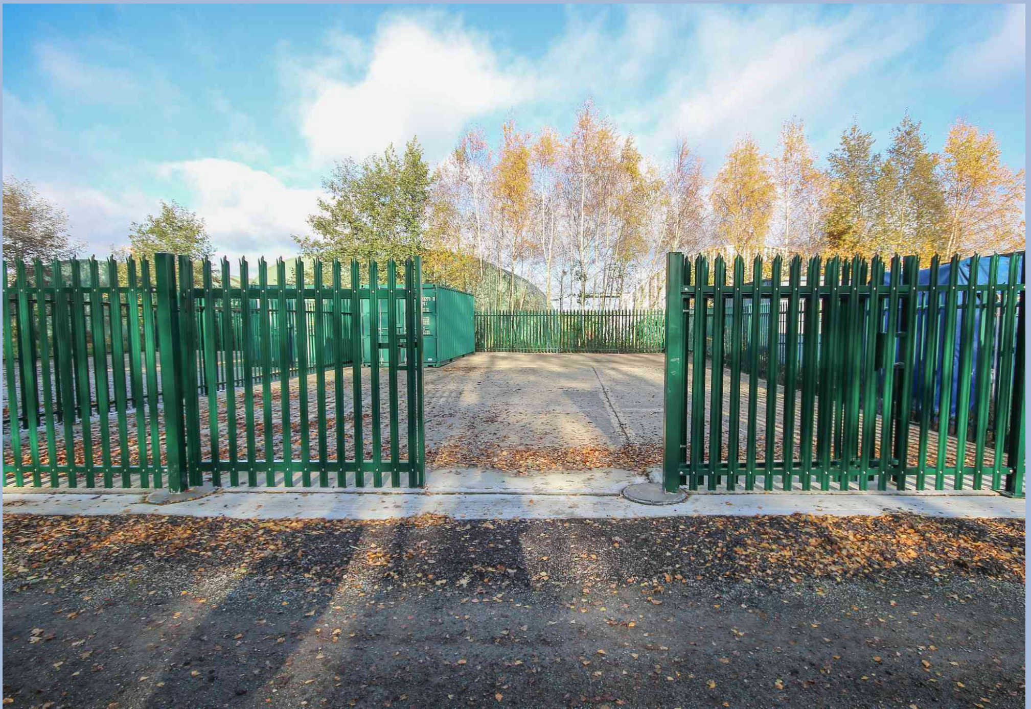
Yard B, The Old Station Yard, East Winch £5,000 Per Annum