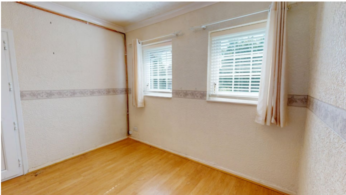
Bedroom with Closet and W/C