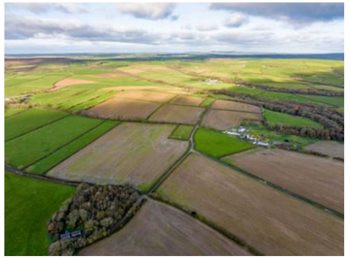
Lot 4 35.477 acres