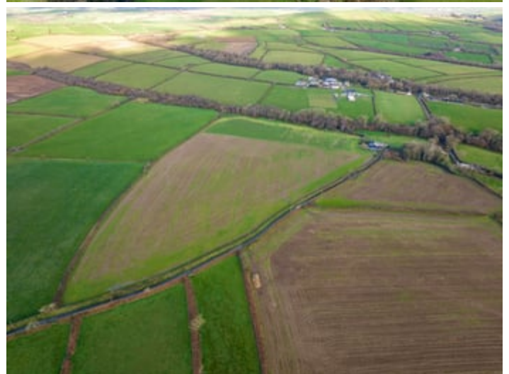
Lot 5 25.223 acres