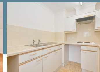
Flat 41, Southdown Court, Bellbanks Road, Hailsham, East Sussex BN27 2AT