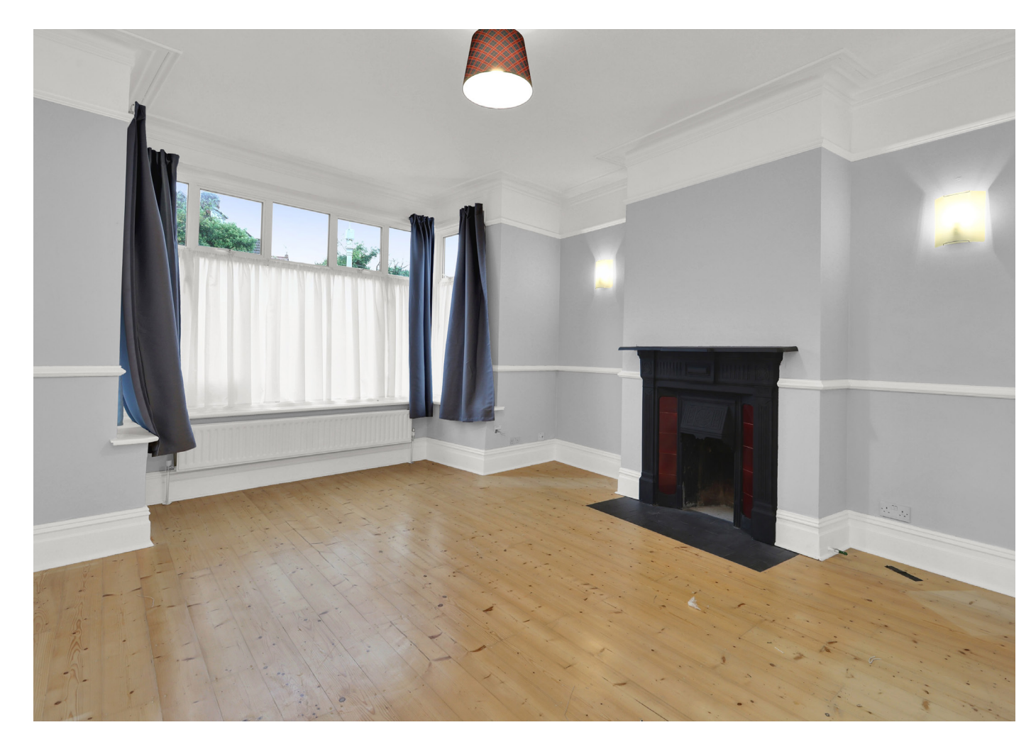
4 BEDROOM HOUSE