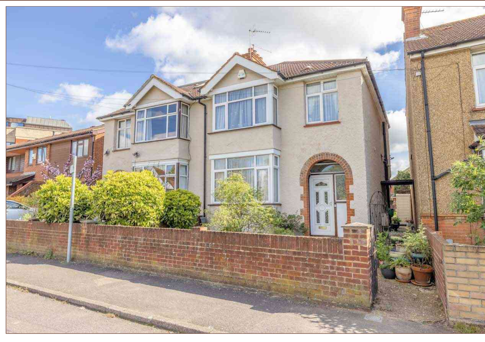
Located in the highly sought after Upton area of Slough is this homely semi-detached property which is ready for your family to make your long term home. With Upton Court Park on your doorstep providing access to large open fields, Slough cricket, rugby and hockey club your family will never be short of weekend activities.

This semi-detached property consists of THREE good size bedrooms and family bathroom on the first floor. The ground floor is home to TWO separate reception rooms allowing ample space for the entire family plus the separate kitchen, brand new downstairs WC and ample under stairs storage. Through the rear kitchen door we can enter the private enclosed rear garden which is around 100 ft long. The potential to extend this property is endless with rear extensions and loft conversion all possible stpp.