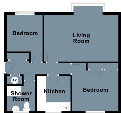
Total area: approx. 51.0 sq. metres (549.3 sq. feet) For illustration purposes only - not to scale