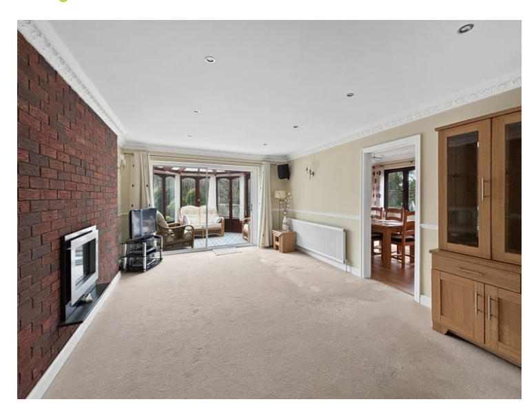
18'\,3'' \times 12'\,0'' (5.56m x 3.66m) Double glazed patio doors opening onto conservatory, inset spotlights, two radiators, feature wall with fireplace.