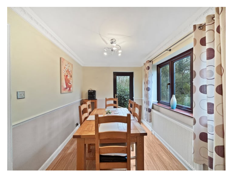
11'4" \times 7'10" (3.45m x 2.39m) Double glazed window to side, door to rear and radiator.