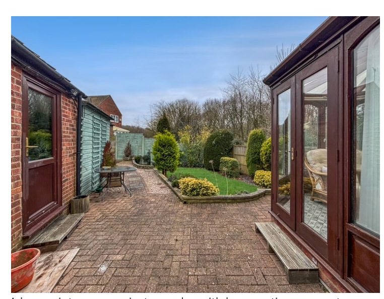
A low maintenance private garden with lawn, patio area, mature shrubs and bushes, retained by fencing.