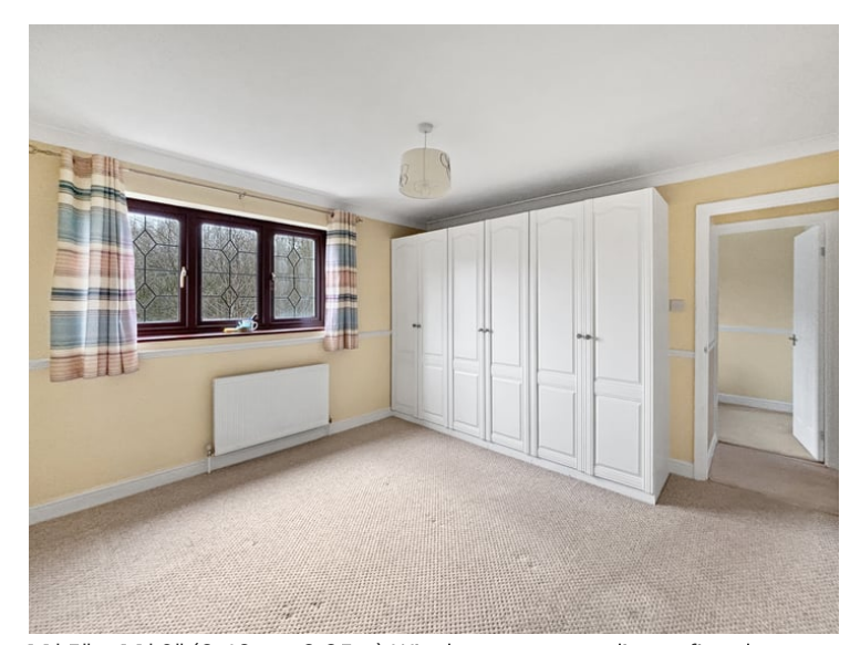
11'5" \times 11'0" (3.48m x 3.35m) Window to rear, radiator, fitted wardrobes.