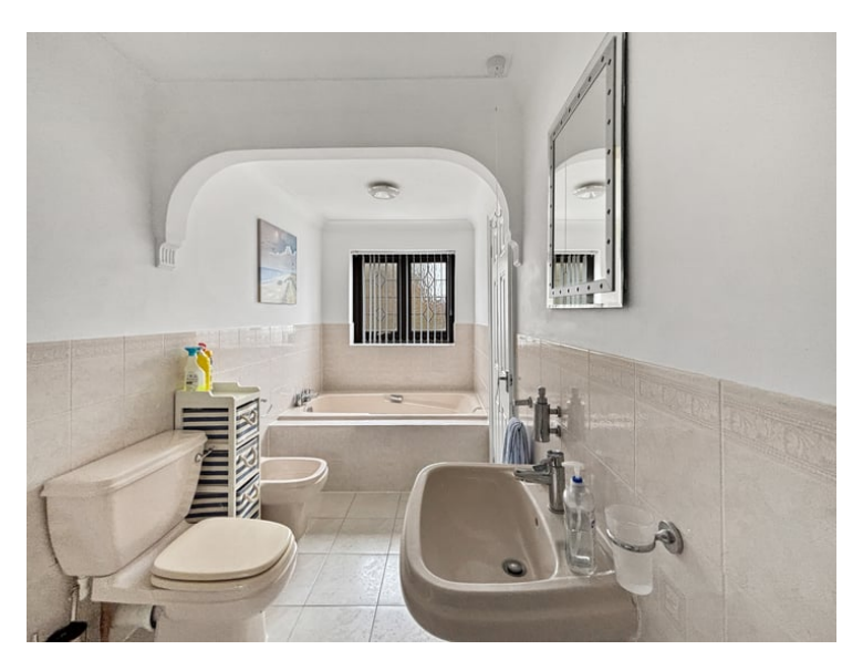
13'6" \times 5'6" (4.11m x 1.68m) Obscure window to front, tiled floor, radiator, paneled bath, low level WC, shower cubicle.