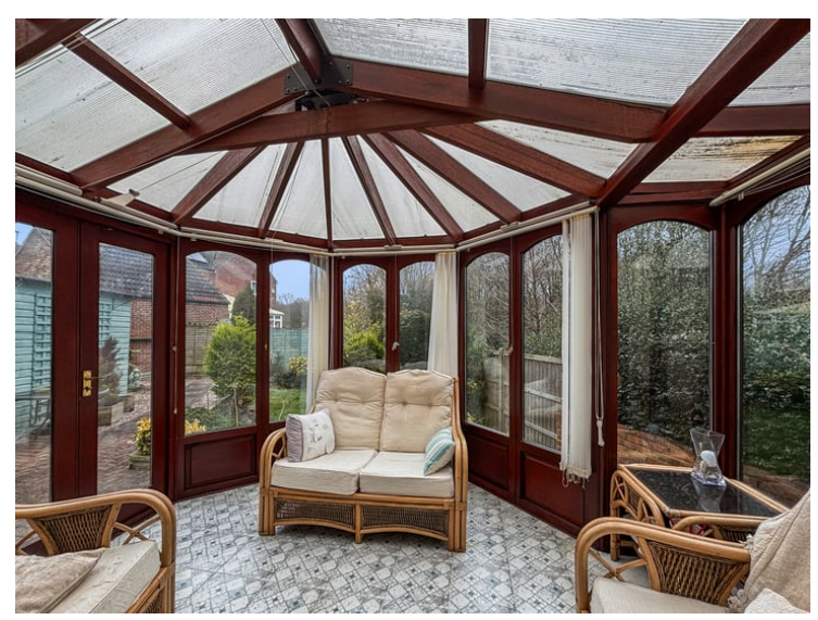
Windows to side and rear, door to rear garden, tiled floor, radiator.