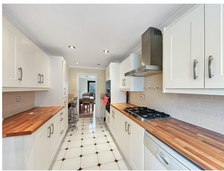
16'\,11"\,x\,7'\,9" (5.16m x 2.36m) Double glazed Window to front, tiled floor, wall mounted boiler, inset spotlights, fitted kitchen including shaker style wall and base units, laminate worktop, sink, breakfast bar, integrated oven, microwave, gas hob with extractor over, space for dish washer/ washing machine.