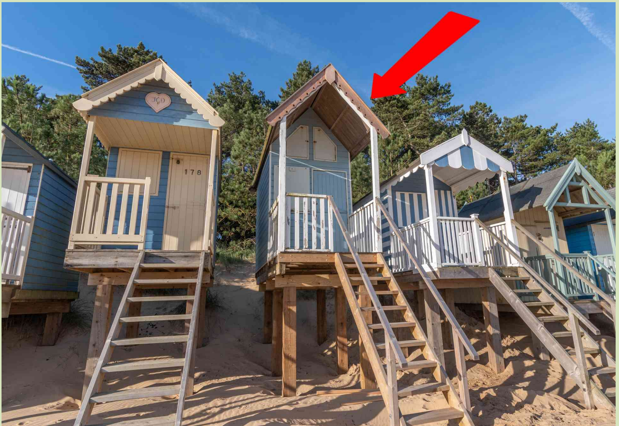
Beach Hut 179, Wells-next-the-Sea Guide Price £90,000