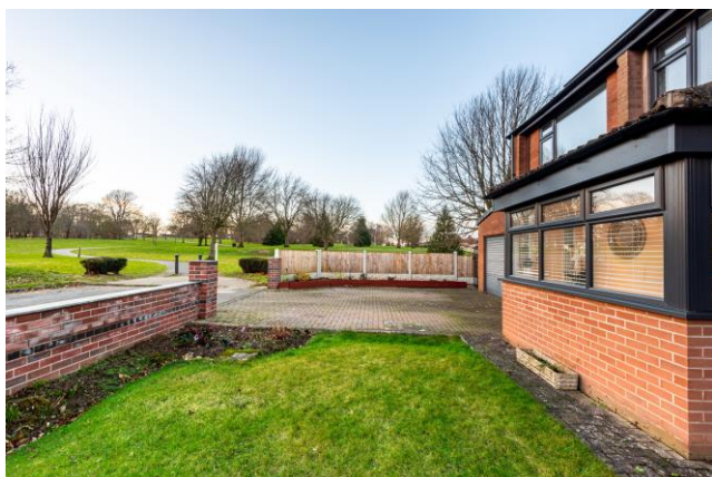
FRONT GARDEN & PARK VIEW

NB: The property has the added benefit of a security alarm.