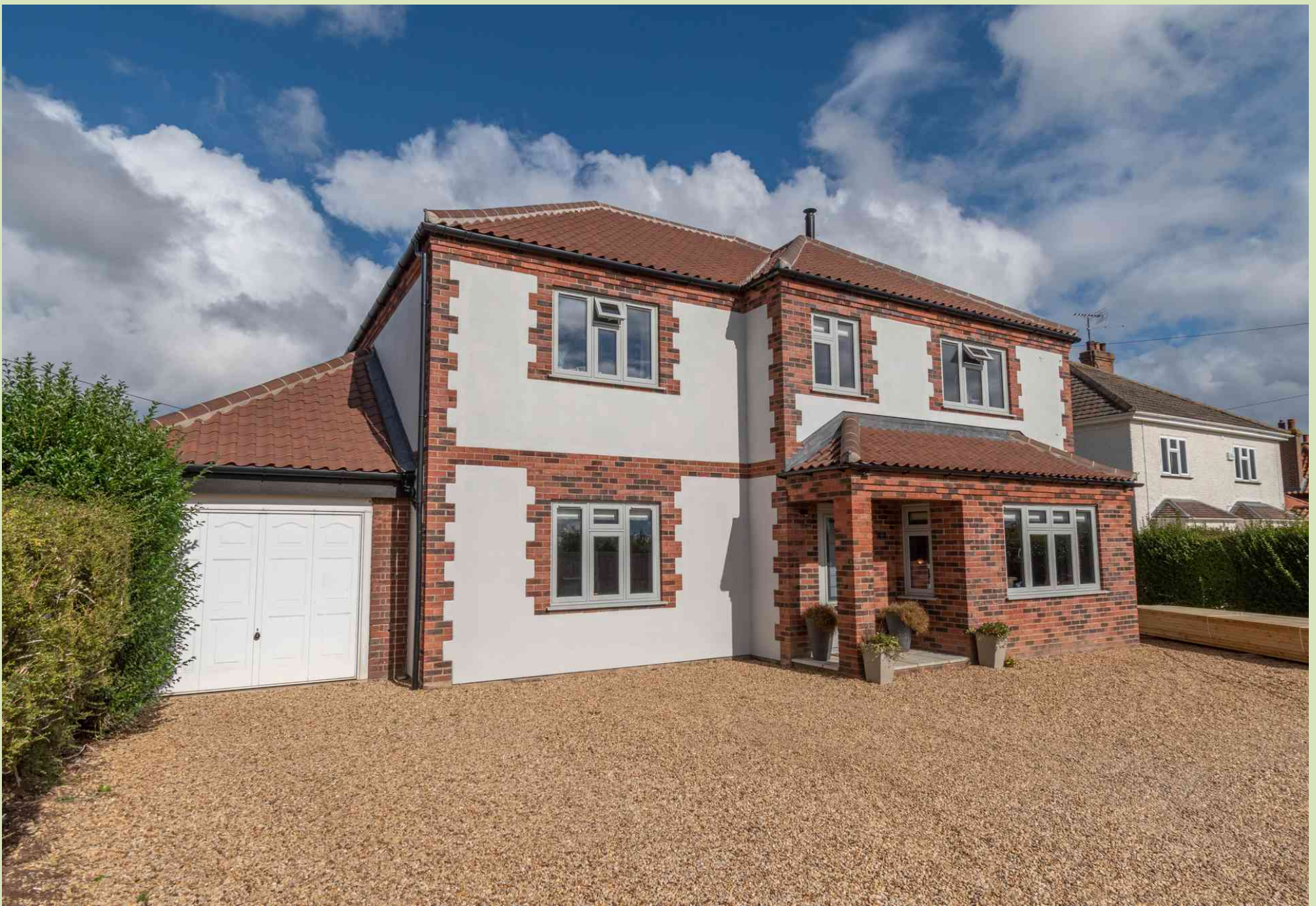
Hillcrest, Wells-next-the-Sea Guide Price £1,200,000