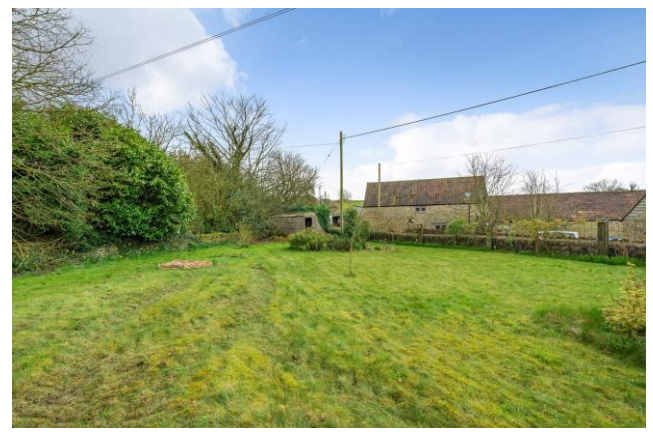
Auction Guide Price £350,000 to £400,000*

Wednesday 15<sup>th</sup> May 2024, 12pm The Theatre, The Royal Bath and West Showground, Shepton Mallet Bidding in person, by proxy or online via livestream