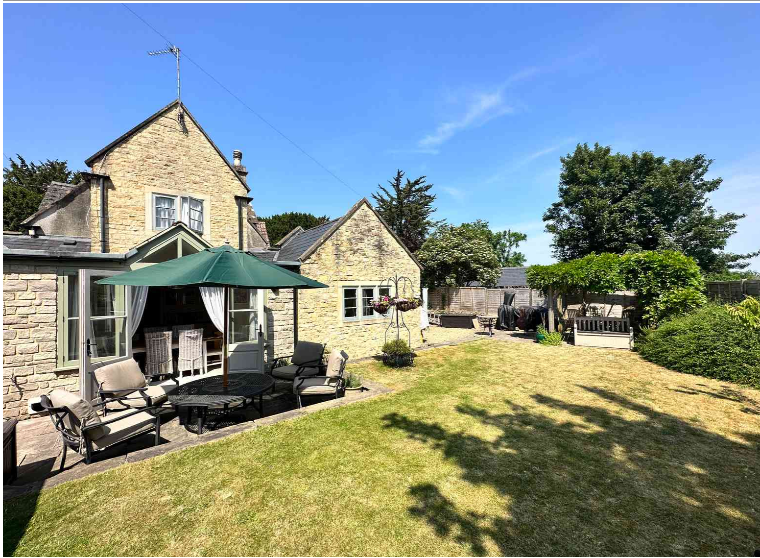
155 Church Cottages, Winsley