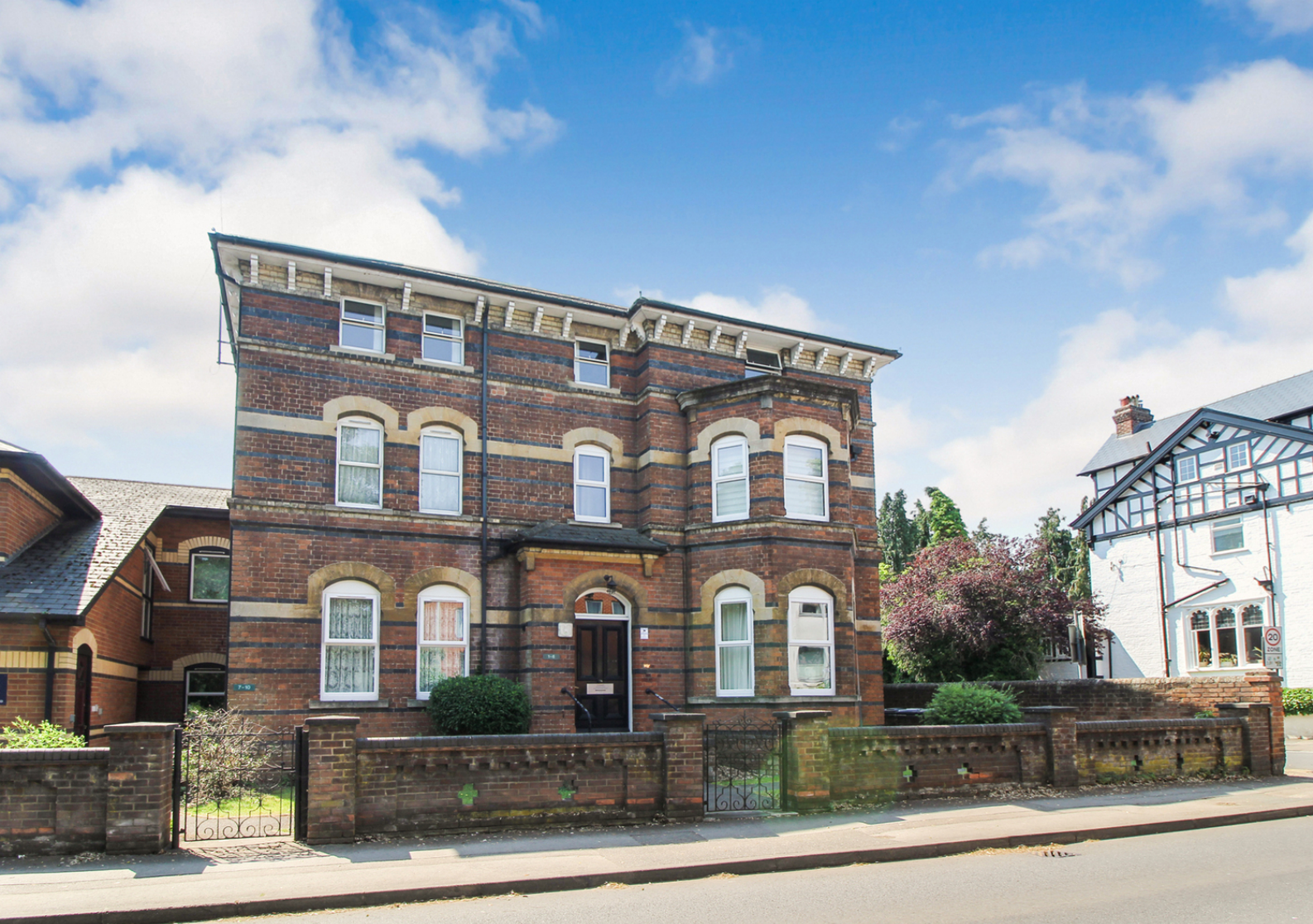
Windsor Court, Tilehurst Road, Reading.